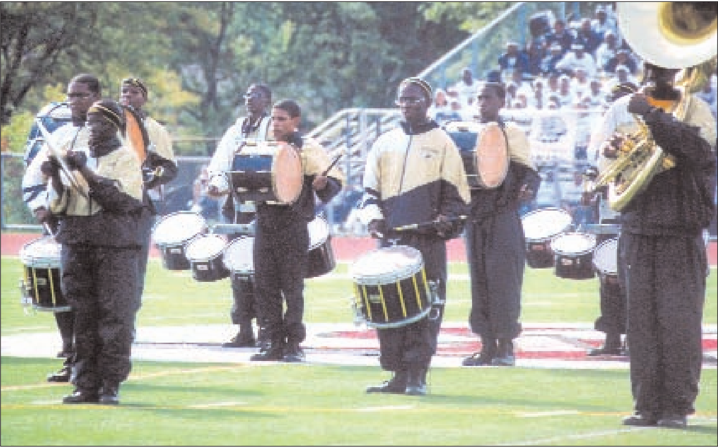
The Martin Luther King Jr. Band is a mainstay at many events including Michigan’s Thanksgiving Day Parade.